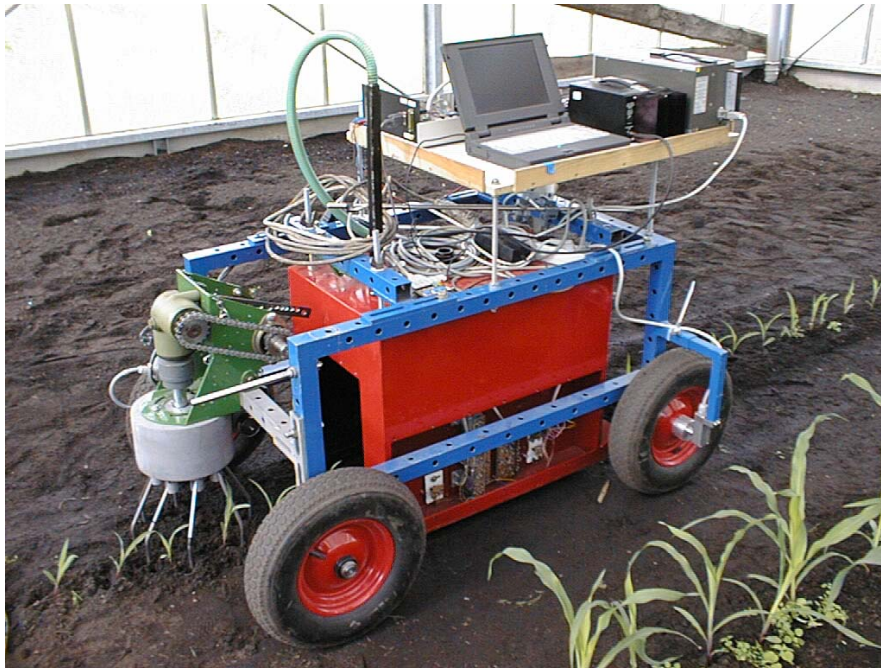
Fig.3: Low-Cost-Modul (LCM) with a mechanical actuator

(position sprayer, mechanical hoe) this would result in a loss of maize plants up to 5 % or an incomplete weed control of 8 %. This number strongly depends on the soil structure and the number and shape of the weed plants.